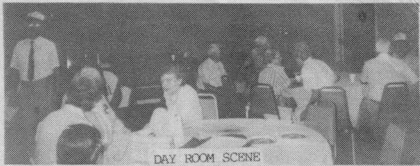
DAY ROOM SCENE