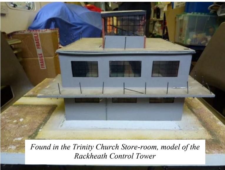
Found in the Trinity Church Store-room, model of the Rackheath Control Tower

And for always remember the boys of the American 2 nd Air Division – they sleep now – who for near this old church took off on their last mission for our freedom and their everlasting glory. Their names – like yours – may one day be forgotten, no matter. They have gone to life eternal, which awaits the brave, and many men's hands welcomed them into paradise. They were men with splendid hearts.”