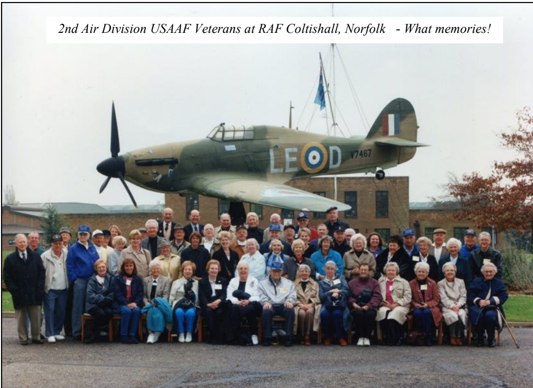
2nd Air Division USAAF Veterans at RAF Coltishall, Norfolk - What memories!