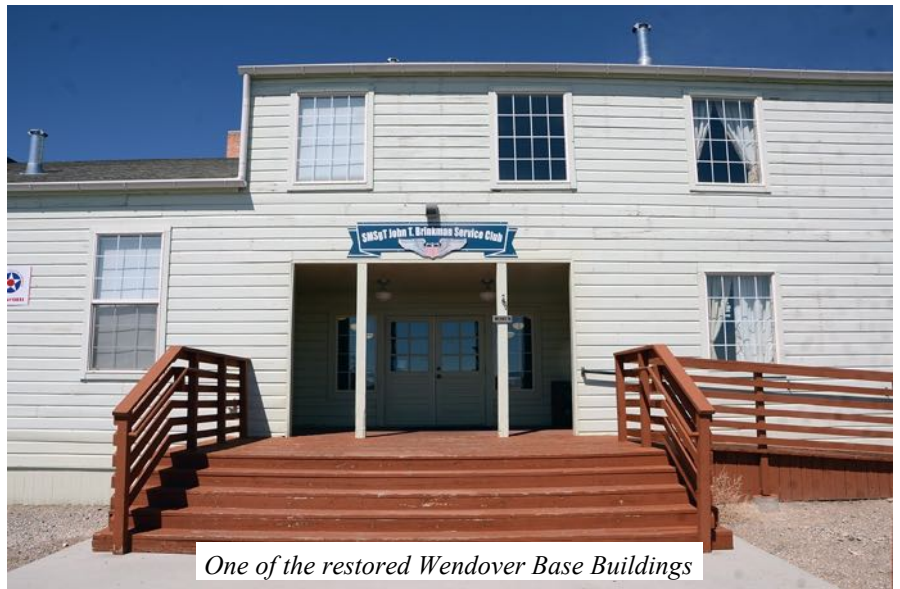
One of the restored Wendover Base Buildings

The 467th BG(H) was formed, and did their group training, at Wendover AAB. The airfield and many of the original buildings still exist today. There is an extensive effort to bring many of these significant buildings into their former condition. The control tower and building have been the main museum at the airfield for many years. Recently, an expanded museum and banquet facility have been opened in the restored Base Officers Club building.