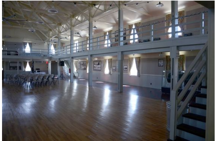
Pictured left is the restored Service Club at Wendover, the likely destination of the Group sponsored B24 Model while the Banquet facility on the right offers space for telling the 467th story in a series of exciting displays and exhibits.

Please continue to send news, articles, and 467th BG related material to share in "POOP from Group"