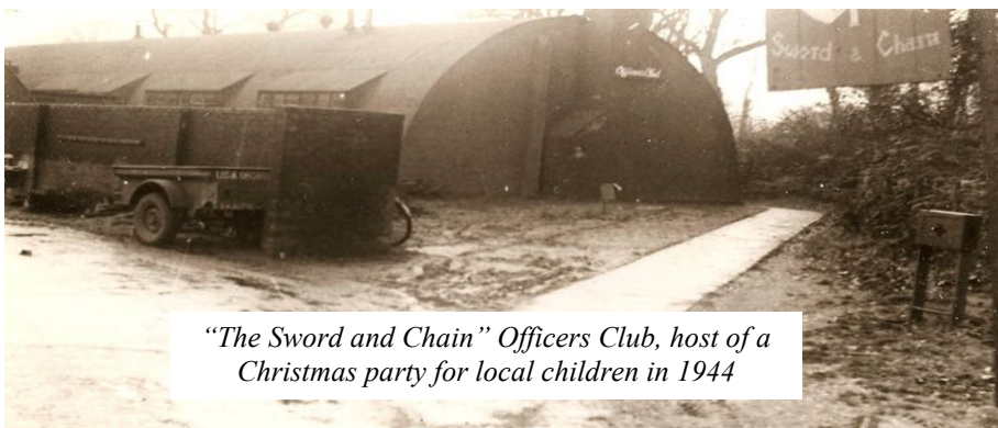
"The Sword and Chain" Officers Club, host of a Christmas party for local children in 1944

In conversation with a cousin of my late wife, He recalls vivid memories of attending with other Rackheath children the 1944 Christmas party in the Officers Club. It was quite an experience actually finding the concrete path to the Club, with someone who had first walked along it in 1944.