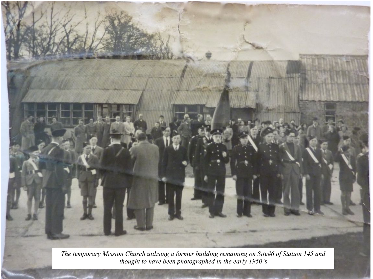
The temporary Mission Church utilising a former building remaining on Site#6 of Station 145 and thought to have been photographed in the early 1950's

Talking to a member of the congregation who tells me that she was a child at Rackheath during the war. She well remembers just post war attending what was then known as The Mission Church, that was a Nissan hut located at Site 6. Remarkably she has kept this photograph of it, which is thought to date from the early 1950s. We are currently researching its precise location and any other relevant information about it.