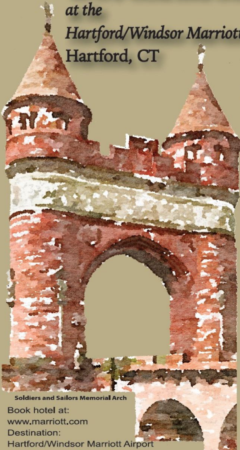
Soldiers and Sailors Memorial Arch