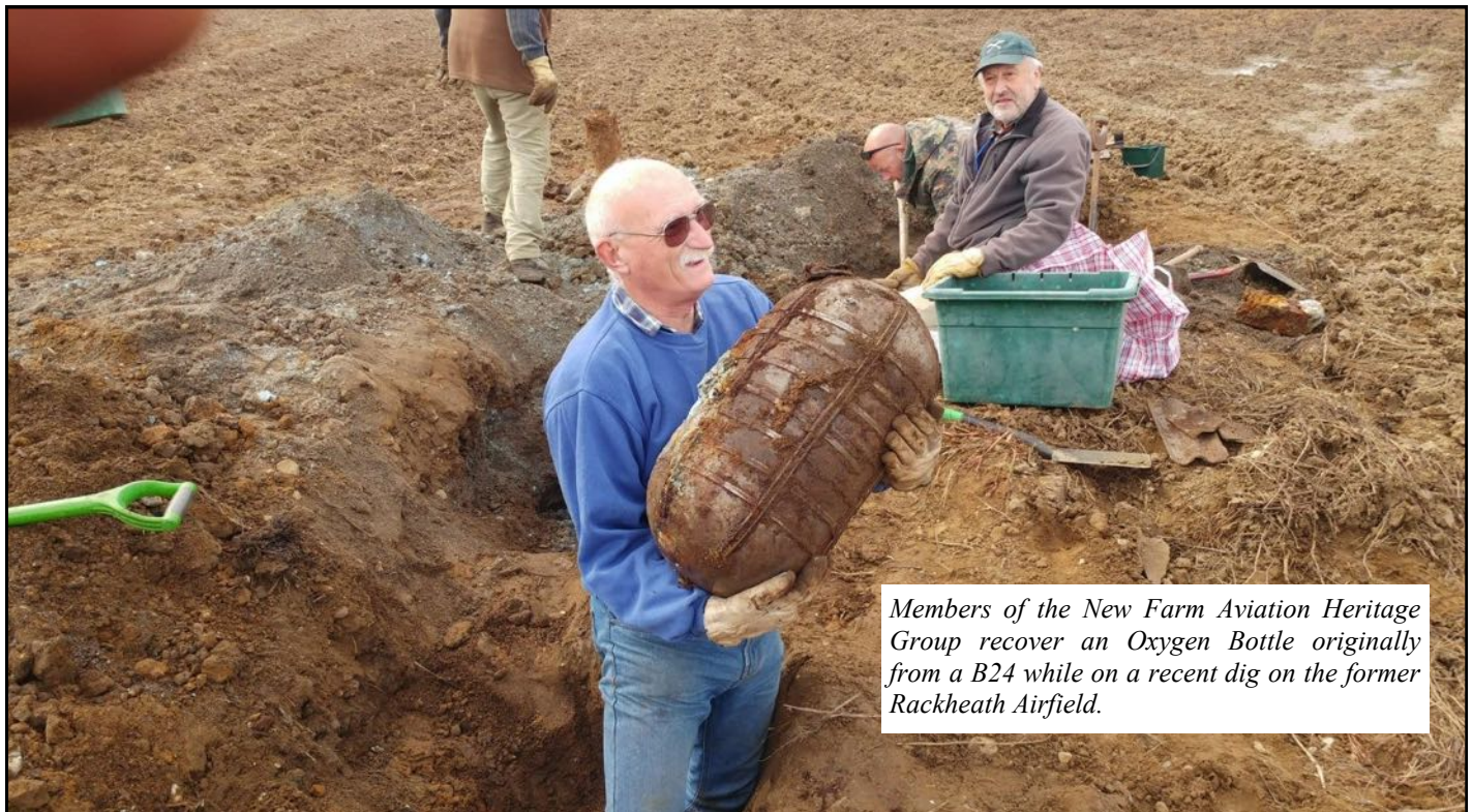
Members of the New Farm Aviation Heritage Group recover an Oxygen Bottle originally from a B24 while on a recent dig on the former Rackheath Airfield.