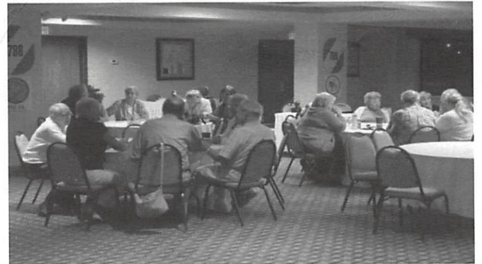
Friday Night Dinner