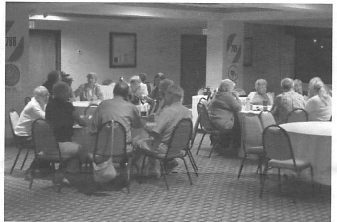
Friday Night Dinner