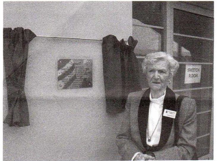
Mrs. Shower at the wall plaque outside the building