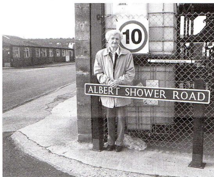
Mrs. Shower at the new road sign

Below are two pictures taken by Perry Watts following opening.