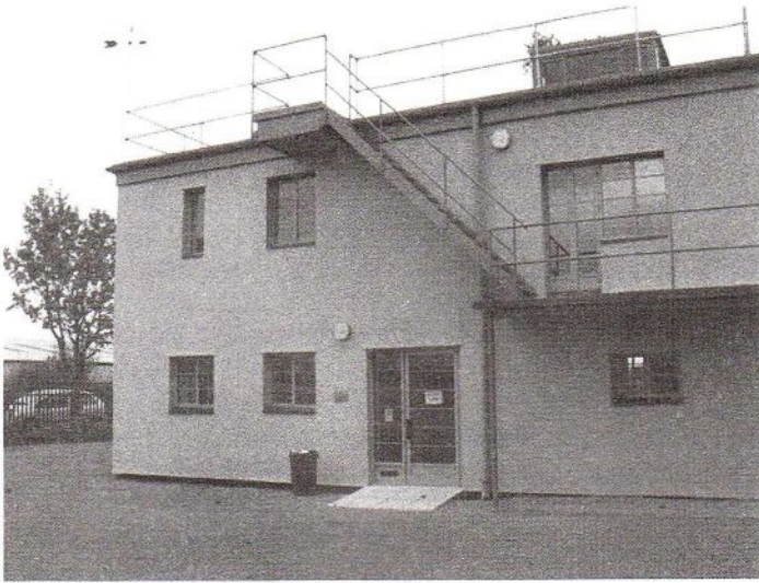
One view of the Building