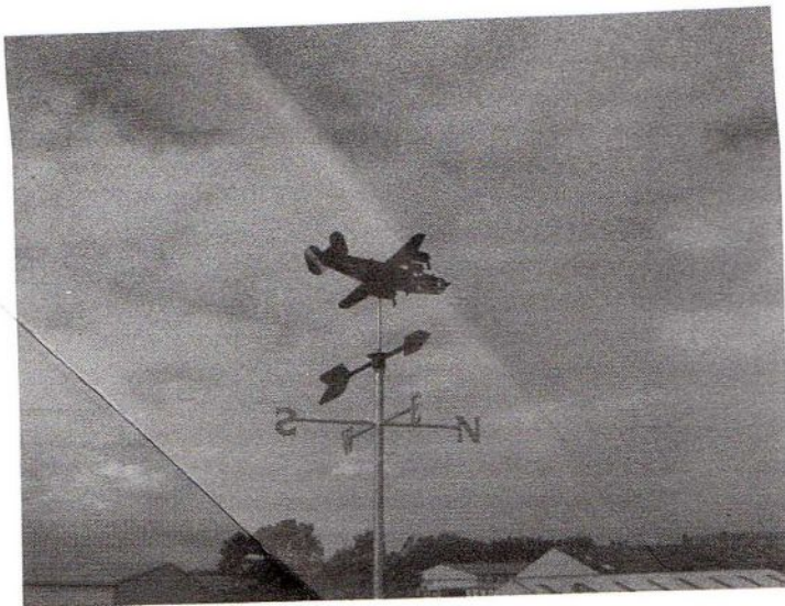
Red & White tails over Control Tower once again!