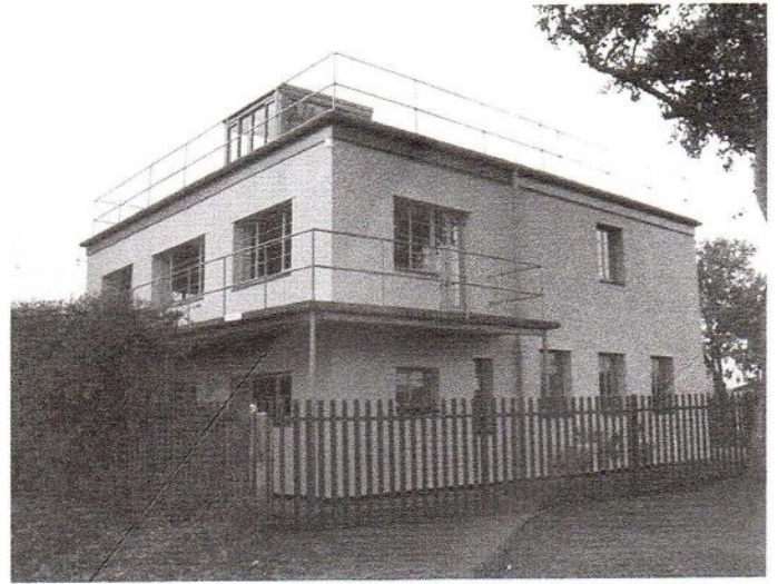
Another view of the Building